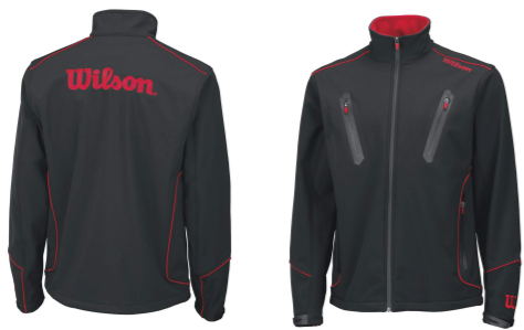
Wilson jac € 99,95