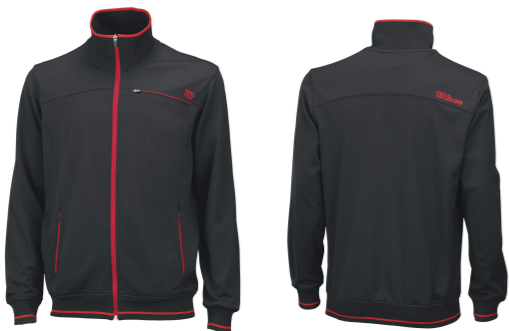
Wilson Track jacket € 59,95